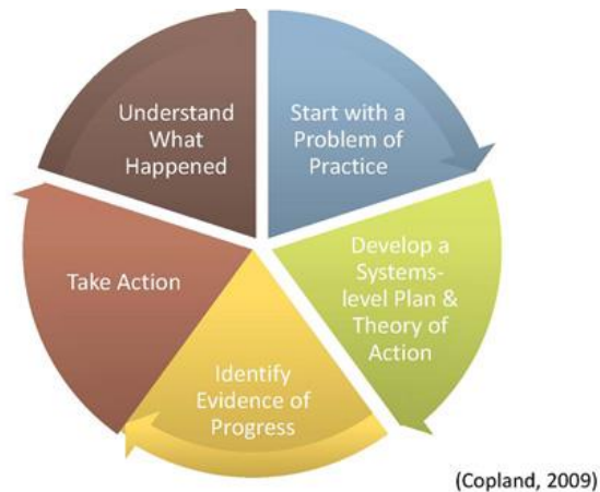
Table 1: Cycle of Inquiry

Enriching the academic efforts surrounding student improvement are professional development initiatives that support educator growth and development. Grounded in the 2018 Professional Development Plan, South Hadley educators will be provided with opportunities to continue to engage in long-range and highly effective workshops including Positive Behavioral Intervention and Supports (PBIS), Studying Skillful